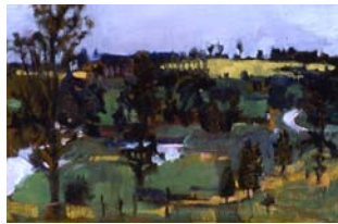
The Grand at Pilkington, Isabella Stefanescu, Oil on Masonite

Isabella Stefanescu's show deciphers the pattern of fields, trees, grasses, buildings, and fences, to become individual glances translated into individual brush-strokes. The sum of which creates innovative paintings. Stefanescu writes: "I look for landscapes that the imagination can enter, even if real access might be temporarily blocked by a chain-link fence."