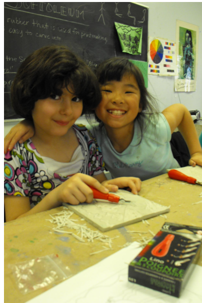
Homer Watson House & Gallery Explorations in Mixed Media & Printmaking!

For more information visit our website at www.homerwatson.on.ca